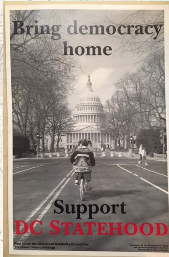
“Bring Democracy Home” Poster