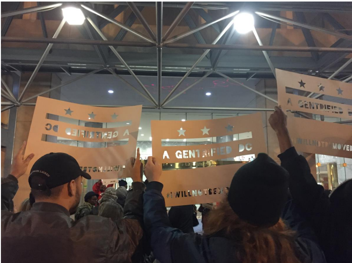
Figure 13. Protest Outside One Judiciary Square

When it hit seven o'clock, we all formed a seething mass trying to get into the building and through the arduous process of getting signed in. When I finally got a seat in the zoning chambers, it was nearly full, and soon people were taking up all available