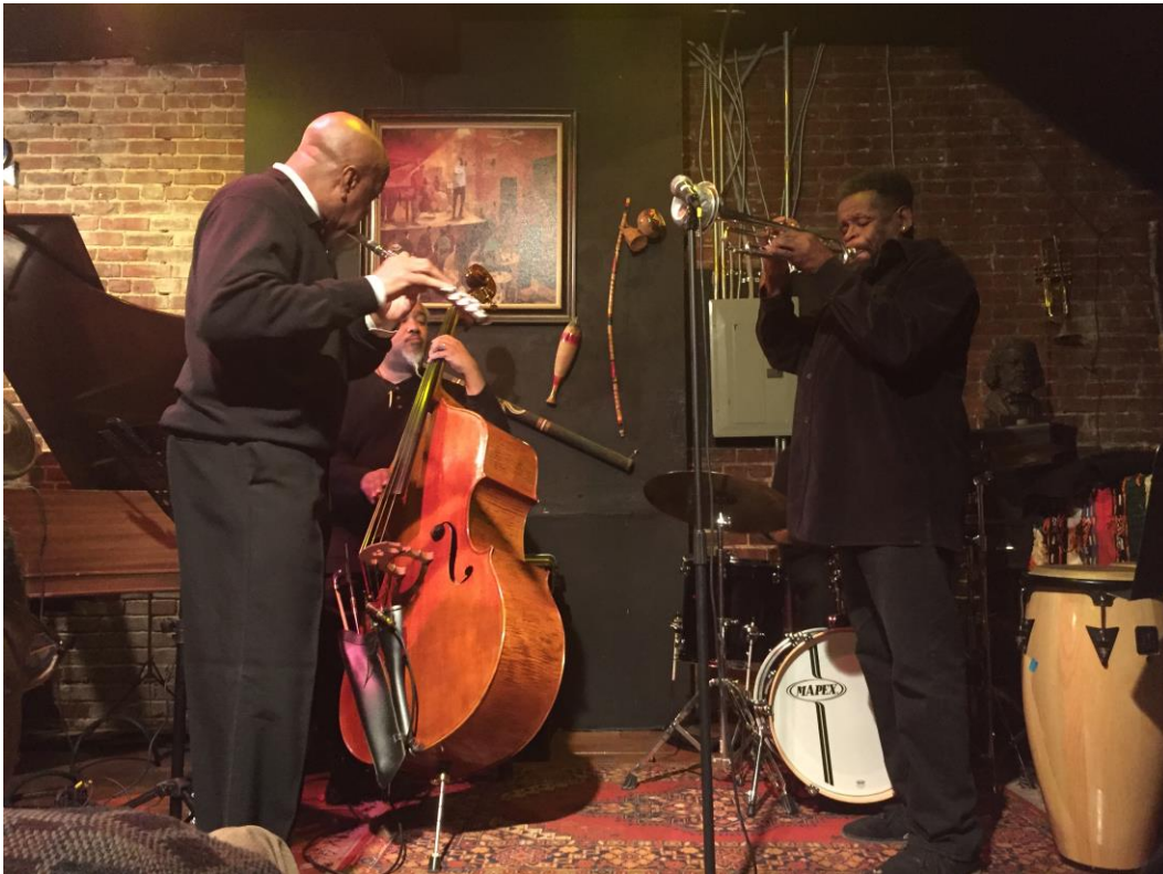
Figure 8. Musical Bow and Bust of Frederick Douglas on Stage at JACS.