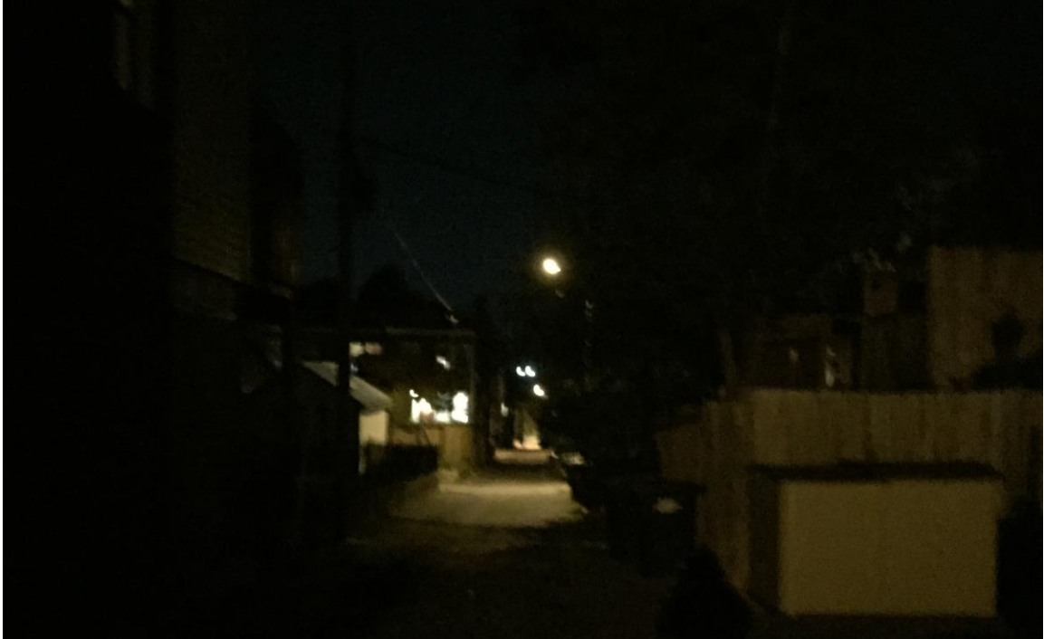
Figure 10. Alleyway leading to Paperhaus

In considering the location of the performance space, it was significantly less physically accessible than JACS or Westminster. 38 At JACS, street parking on the same block as the club is usually available, and at Jazz Night there is a parking lot behind the church, and the Waterfront metro is one block away. At Paperhaus, street parking was available, but required no small amount of searching, and I ended up having to park a couple of blocks away, even twenty minutes before the show began. Walking to the venue was not an issue for me, but as an older male patron at JACS explained to me, a club's physical location was a key factor in what shows he could go to. As an "old man" he couldn't be out walking around by himself at night, because felt that he would be a