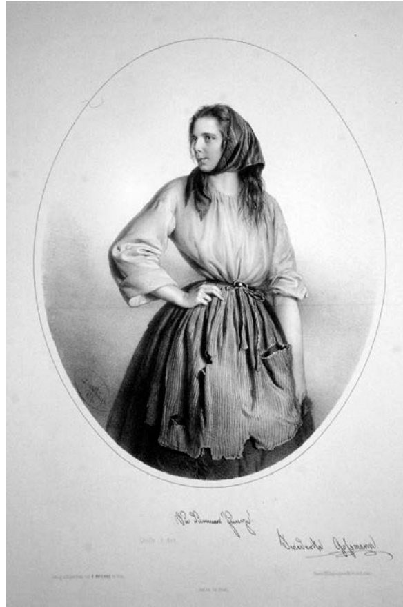
Figure 4 Adolf Dauthage's 1857 Lithograph of Friederike Gossmann as Fanchon

Barbeaud's gesture and claiming their authority for herself. The Fanchon of Gossmann, on the other hand, undermines the critiques embedded in the text of Die Grille . Dobbert is more comfortable with Gossmann's performance of the same scene. This difference in his relation Raabe and Gossmann's acting illuminates the text's helplessness without a critically-minded actress.