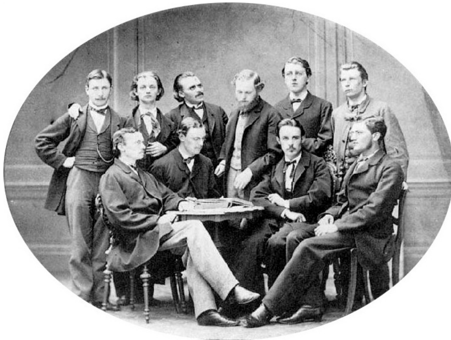
Figure 3 The Leipzig Philologist Society in 1866 [Nietzsche 3rd from left in back row]