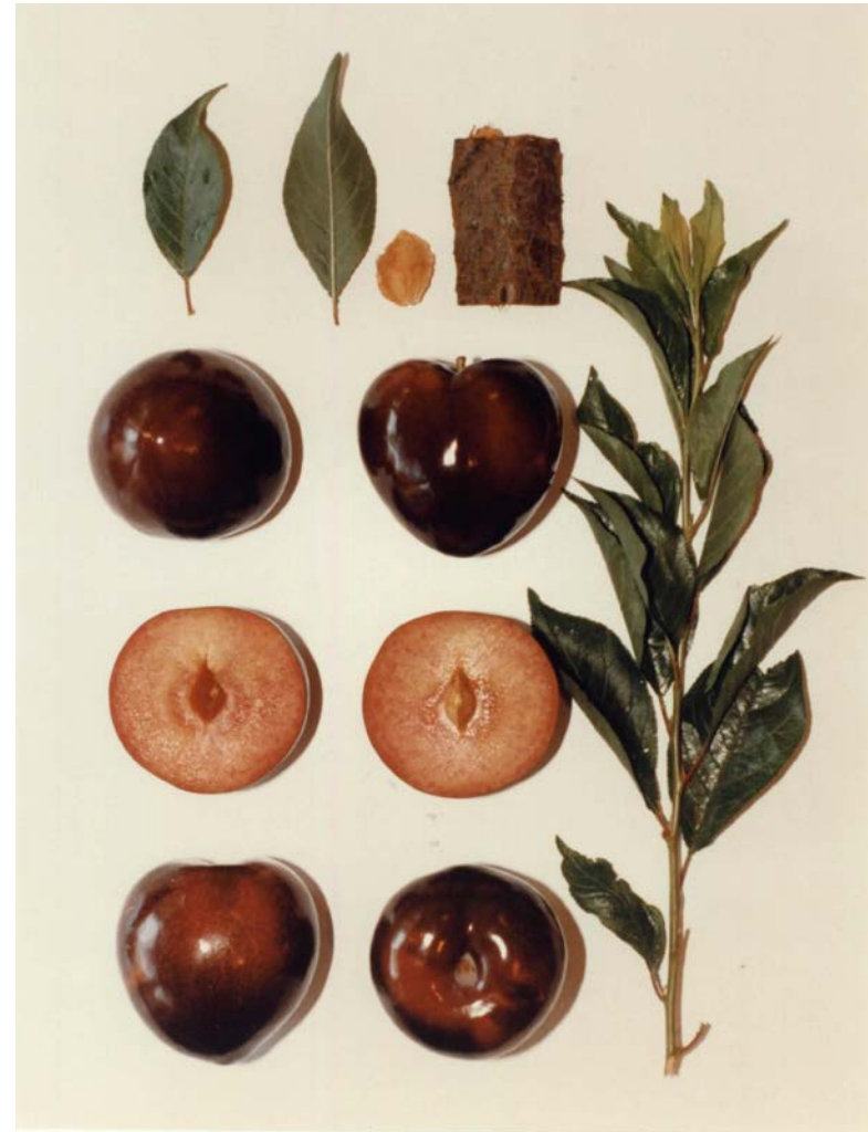
Primetime plum tree