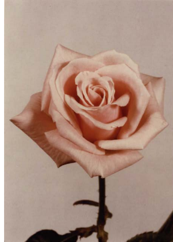
Hybrid Tea rose plant named 'selloby'