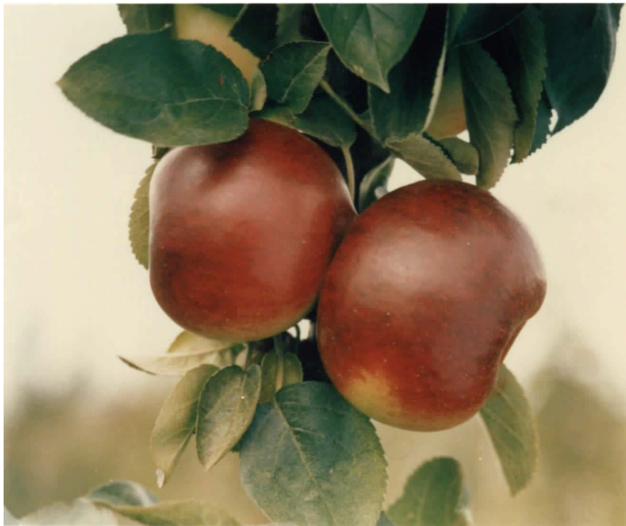
Columnar apple tree -- Obelisk variety