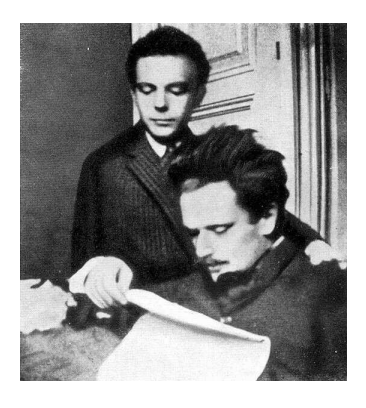
Fig. 1.1 The lifelong collaboration of Béla Bartók and Zoltán Kodály

These ideals would propel these two composers' research over the next several decades, evenually culminating in many song settings of increasingly complexity, including those presented this evening. The body of their several decades of research was eventually published in the mammoth treatise on the subject, A magyar népzene (Hungarian folk music) in 1951. The ten-volume edition had been conceived of by both composers in 1913, and included folksongs that numbered over 100,000. Due to the lifetime commitment to and love of the music of their homeland, generations of world musicians have benefitted from their life's work, both from their extensive and well-codified research, and their creation of a truly Hungarian form of art song.