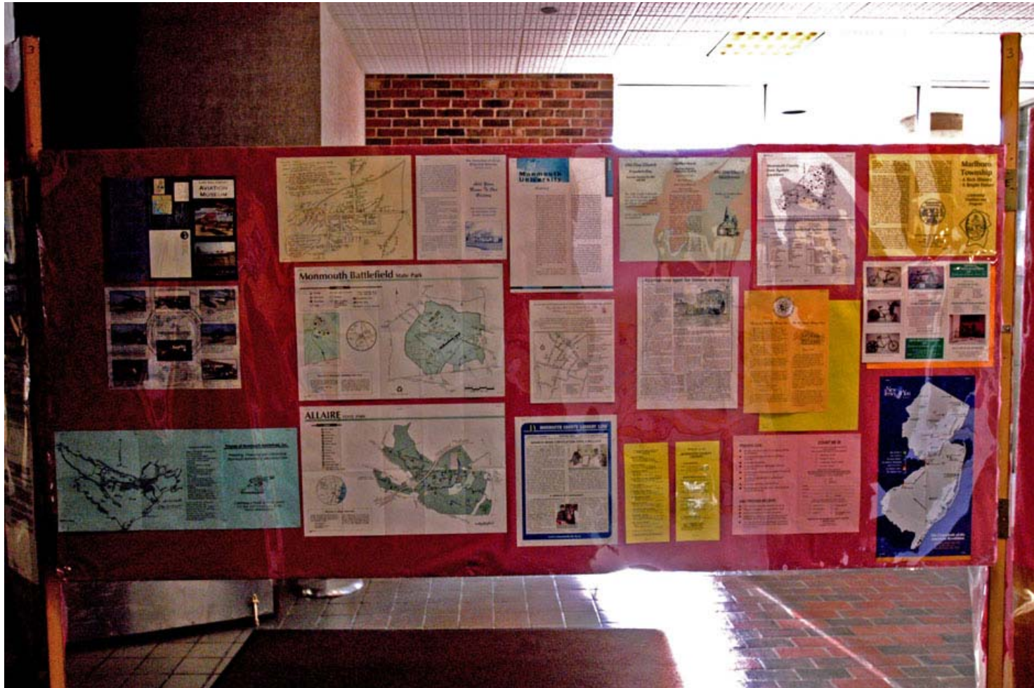
Exhibit in Library Lobby on 24 panels (discontinued)