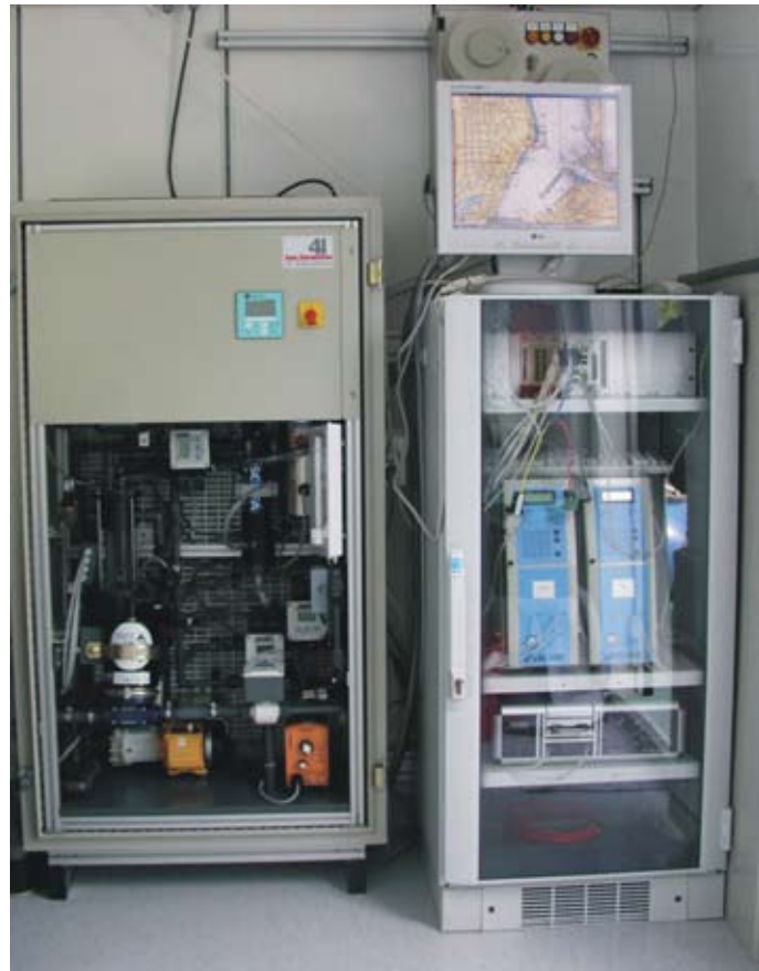
4H Ferrybox with data-logging and data display