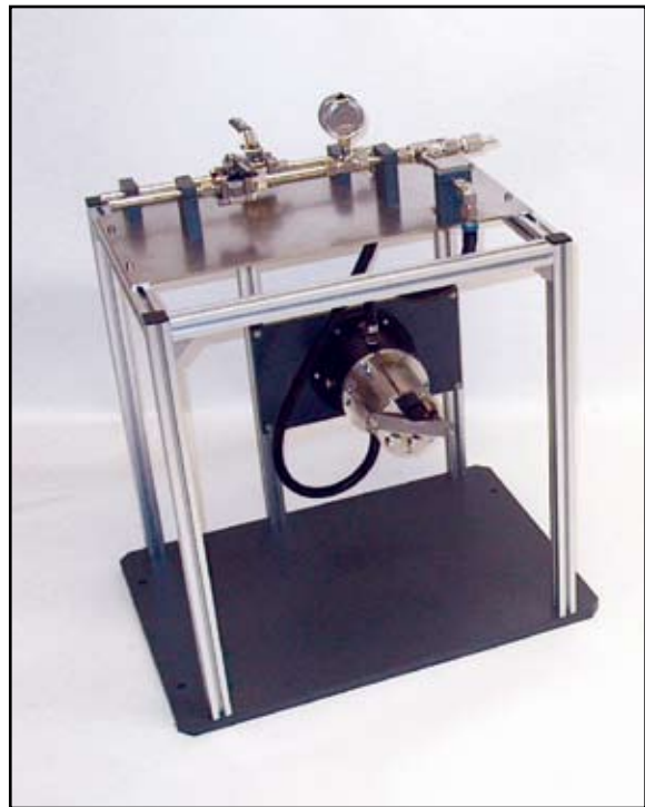
Frame and GPS