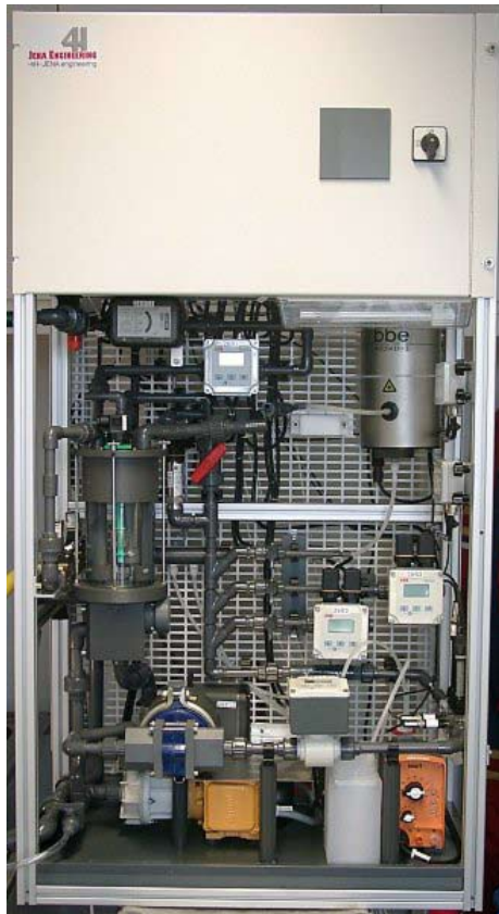
4H JENA Ferrybox

A new automated monitoring equipment (“4H FerryBox”) has been developed by the 4H- JENA engineering GmbH in Cooperation with the GKSS Research Centre, Institute for Coastal Research. This 4H FerryBox system is a new operational tool using ferries and other “Ships of Opportunity” as carriers and platforms for automated monitoring equipment. The experiences within the EU project demonstrate clearly that such systems can cost-effectively deliver reliable high frequency data and thereby improve, supplement, and even optimize (in terms of reduction of maintenance efforts and running costs) conventional monitoring strategies. The 4H FerryBox system consists of a seawater intake, a debubbling device, a main loop with sensors for temperature, salinity, pH, oxygen, turbidity, and algae abundance. The water of another loop is filtered for analysis of ammonium, nitrate/nitrite, o-phosphate, and silicate. A main feature of the system is the implemented self-cleaning procedure: critical sensors are automatically cleaned with acidified water and rinsed with tap water in order to avoid biofouling and to keep the sensors clean and stable over a long time. For applications in tropical waters, an additional chlorination is available. Such systems will be an important topic within the GOOS (Global Ocean Observing System) and EuroGOOS Framework.