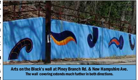
Arts on the Block's wall at Piney Branch Rd. & New Hampshire Ave. The wall covering extends much further in both directions.

on the Block studio for the first meeting of a three session, eight month program with five partners—Arts on the