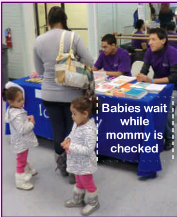
Babies wait while mommy is checked