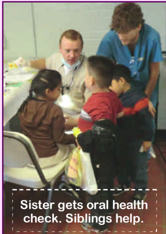
Sister gets oral health check. Siblings help.

November 6th was the date for the health fair called "Health Check," held annually at the Langley Park Community Center and open to all comers for free.