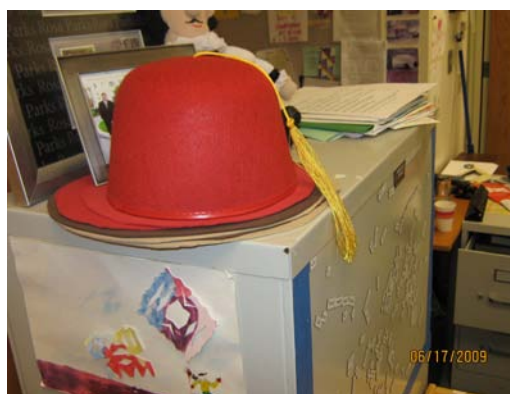
Joha's hat worn by each student for the final performance