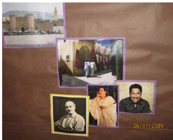
MENA bulletin board in music class

The following vignettes are from my observation notes of the MENA unit in music class. They reveal the teaching and learning processes Oliver and the students were engaged in as they explored how to play Al Jeel (Arabic style) rhythms on the drums and compose a piece for their final performance at the Celebration of Learning.