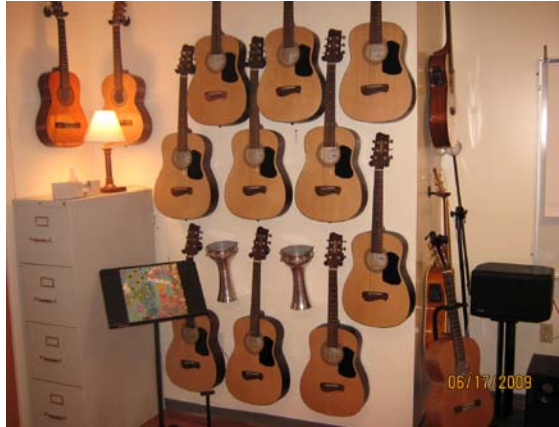
Guitar class was the most popular music elective.

I began to think what is it that kids are really interested in with the guitar? And I asked them at the beginning of guitar, what do you guys want to do in this class? And they all agreed that they wanted to learn songs that they know, songs that they can sing... that was what they wanted to focus on. The focus was on individual interests, what you're really interested in, and my framework was the songs. I had a song from the movie Juno , I had two Beatles songs, Hey Jude , and Let it Be , and I taught them those chords and then, once they learned those, they could research the internet what they wanted to learn. A couple of people wanted to learn Yellow by Cold Play, another guy wanted to learn a heavy metal song and he looked it up and taught himself how to read the tabs and how to play it... class time was used mostly as practice time. I would give them a skill, and then they would practice the whole hour... Sometimes they would focus on that skill and sometimes they would go off... That was the first class where I fell in love with doing small group work, and, because I saw that kids were totally self-motivated... I realized that they got so much further!! I think they got so much further than they would have ever gotten if I were standing up and telling what to do every step of the way, I never thought that kids could learn so many chords and so many songs on the guitar!