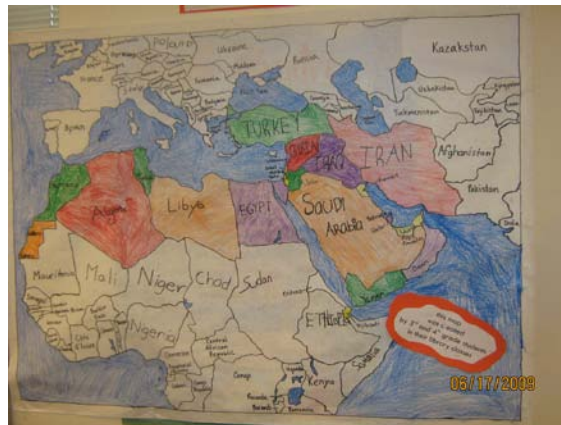
Map of MENA

and without giving them the answers, she asked them to recall their prior discussions to help them remember the countries on the map. Students discussed their answers with each other. After some time, they were directed to go back to the big circle and Linda went over the map by asking them to volunteer the countries' names as she pointed to them on the map. When students offered answers, she simply repeated them without saying whether their responses were right or wrong. If they seemed insecure about their answers, she reassured them by saying that they had only recently learned the map so it made sense if they did not know it yet. Then she revealed a large map of MENA on the wall and went over it, briefly offering information about each country.