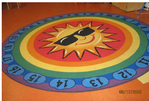
The circle where students gathered with their instruments.