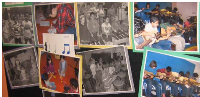
Music Bulletin Board