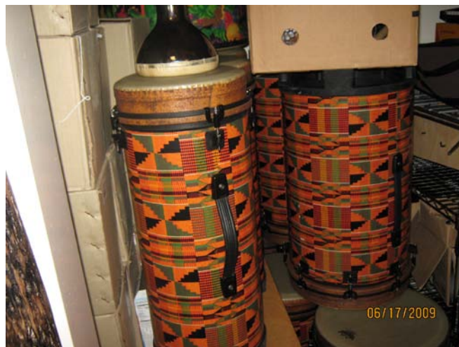
Other drums played during the MENA unit