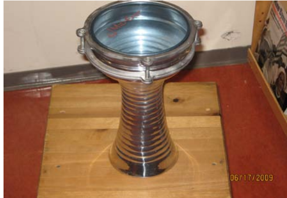
Doumbek (Middle Eastern drum)