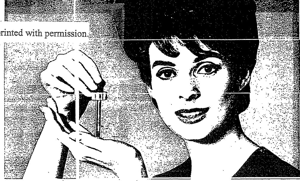
Just 7 Drops a Day-for face and neck

Popularity of serum-type hormone preparations is gaining daily, apparently because the Sesame-Lanolin carrier used in serum carries the full strength of the hormones into the skin, leaving not a trace on the surface.