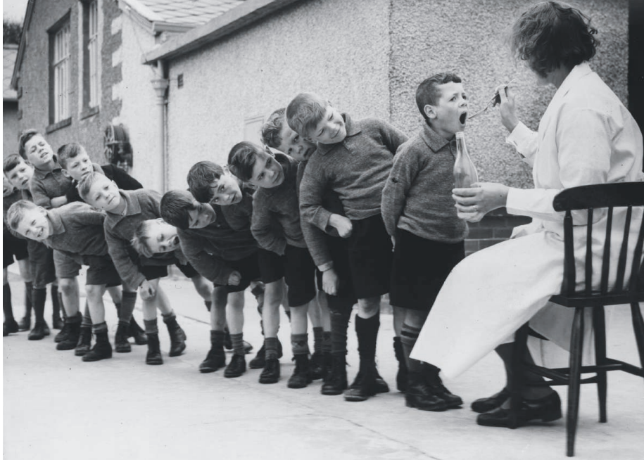
Ounce of prevention. Cod-liver oil has been given as preventative medicine for decades ( left , British children in 1938 are presumably getting their spoonful). Now scientists are amassing tens of thousands of volunteers to test the preventative power of one of its ingredients: vitamin D.