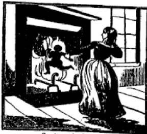
See Narrative, Page 16.

As many of the circumstances related in this Narrative are doubtless still fresh in the minds of many of our readers who have been eye-witnesses of the facts, it is therefore needless to make any comment regarding