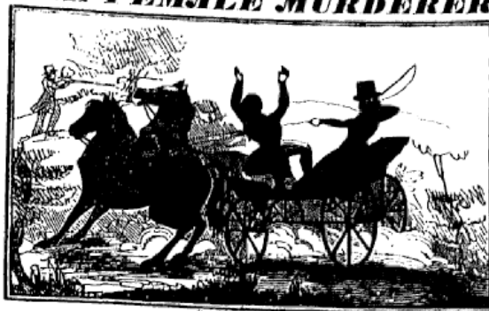
See Narrative, Page 13.